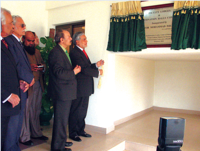
UHS Chairman Board of Governors, Senator Muhammad Ishaq Dar unveiling the plaque of Faculty Lodges and Examination Hall Complex.

UHS has recently been awarded prestigious International Strategic Partnership in Research and Education (INSPIRE) and Development of Innovative System through Knowledge Exchange (DISKE) grants by the British Council for supporting joint academic and research programmes with University of Liverpool, UK.